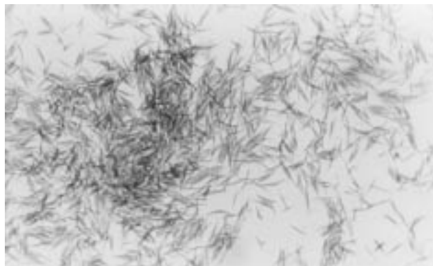
Figure 1. CAR bacillus isolate PigCAR-1 grown on the cell-free surface of a tissue culture dish. Crystal violet stain.

swab collected from a pig at an abattoir. Approximately 100 samples were cultured, 77 from the abattoir, before successfully cultivating PigCAR-1. All abattoir pigs were from a single herd, and examination of histologic slides from the abattoir pigs demonstrated CAR bacillus-like bacteria in 40% of the tracheas, but contamination and overgrowth of the cell cultures by other bacteria was a serious problem. When it was discovered that PigCAR-1 could pass through a filter with a 0.45- \mu\text{m} pore diameter, subsequent samples were filtered before inoculation of IEC-18 cells. When the samples originated from the trachea, 80–90% of the filtered samples were free of bacterial growth other than CAR bacillus and Mycoplasma spp. However, filtered samples originating from the nasal cavities had a high incidence of contamination by Streptococcus spp. and Haemophilus parasuis . For that reason, sampling of the nasal cavities was discontinued.